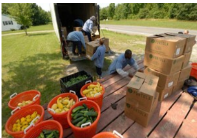
Inmates harvest crops from a farm on the Eastern Shore. Through this PSW project, food is distributed to Maryland's hungry.

The E.R. Cass Award, named for an ACA president emeritus, goes to those corrections professionals who serve above and beyond the call of duty.