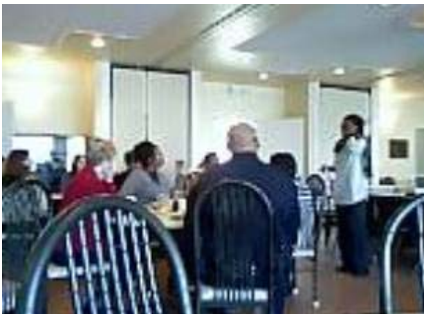
Pen Lucy Women's Breakfast, March 12, 2008

For more information on the programs mentioned please check out their web sites: Turn Around- www.turnaroundinc.org and the Marian House- www.marianhouse.org . Women Accepting Responsibility has no website but can be reached by calling (410) 947-0700.