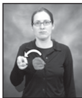
HARD OF HEARING